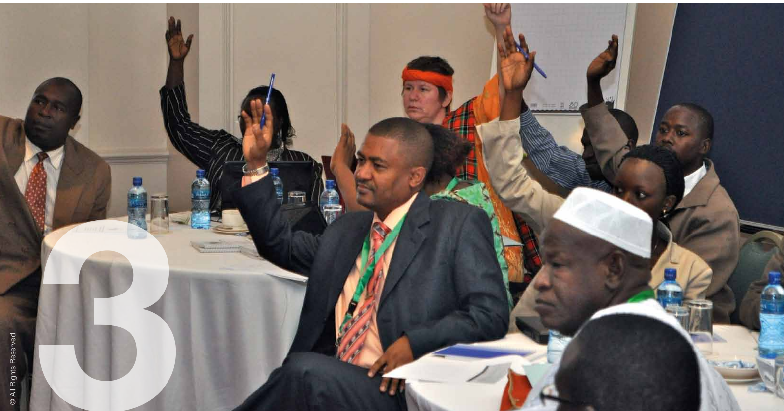
The conference delegates had the opportunity to shape the Nairobi Declaration

Small-scale farming will continue to play a vital role in most developing countries. However, if farmers are to fulfil their potential, they require the best possible access to knowledge and information. The Nairobi Declaration – the key text for the conference – defines and describes the sort of extension services which are needed in these challenging times.