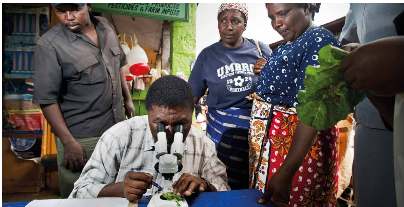
A plant pathologist examines a diseased leaf at a plant health clinic in the Kenyan village of Wangigi. Clinics like these are organised by the Centre for Agricultural Bioscience International.