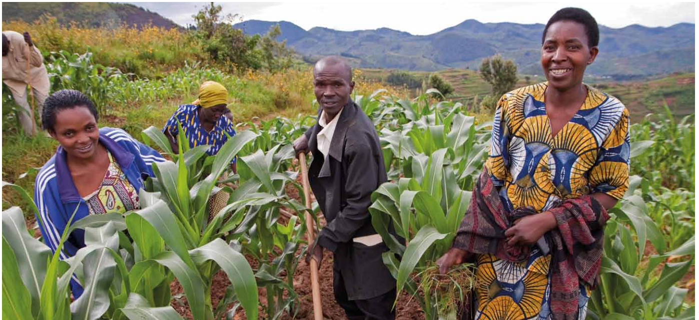
Students and peer trainers in an experimental plot at the farmer’s field school of Ngororero (Rwanda). Farmers learn the value of applying Integrated Pest Management (IPM) to test varieties of maize crops (Support Project for the Strategic Plan for the Transformation of Agriculture).