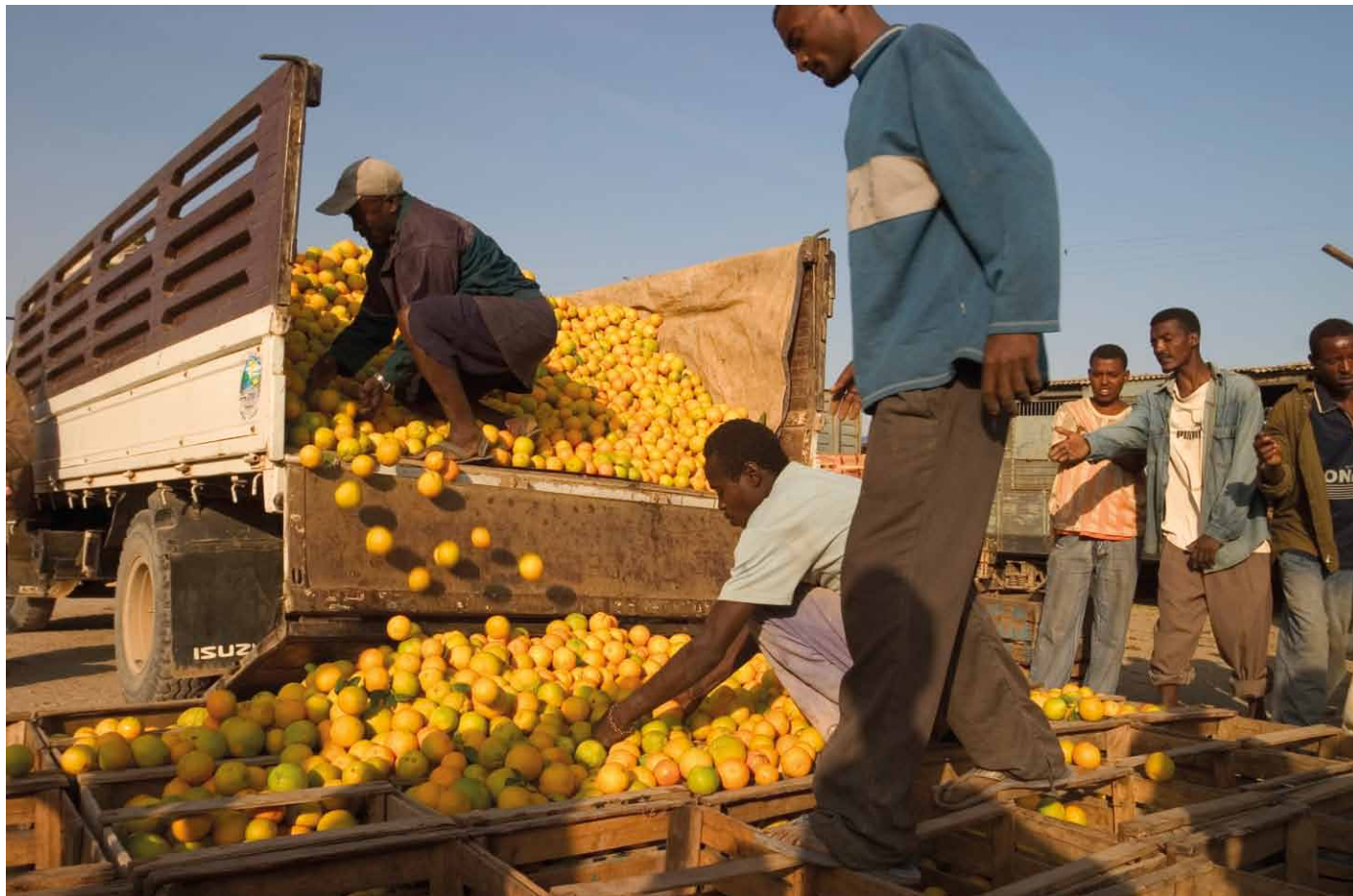
The fruits of success. Extension and advisory services can help link farmers, such as those producing oranges in Ethiopia, to profitable markets.

themselves, extension agents communicating with extension workers, and politicians and policymakers doing likewise. “What we have tried to create through this conference is an environment where everybody, no matter what their interest or profession, communicates openly with everybody else,” he said. “That is why it has been so important to establish this coalition.”