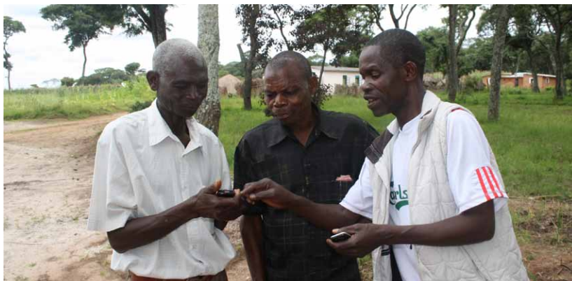
SMS services enable farmers in Zambia to send feedback to a farming programme, indicating what topics they'd like to hear more about. The radio show, which is supported by IICD, is broadcast twice a week in eight different languages.

The number of mobile phones in Africa today. In 1998, there were fewer than 4 million.