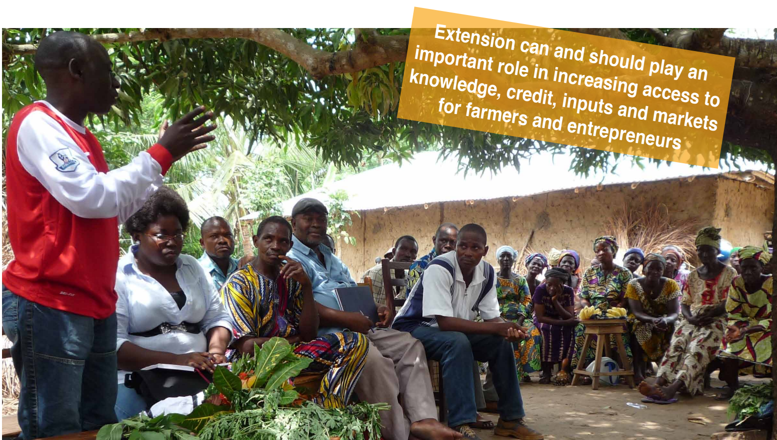
Extension and advisory services will continue to play a vital role in helping small-scale farmers to improve their yields and incomes.

The conference recognized that smallholder agriculture and family farming are of paramount