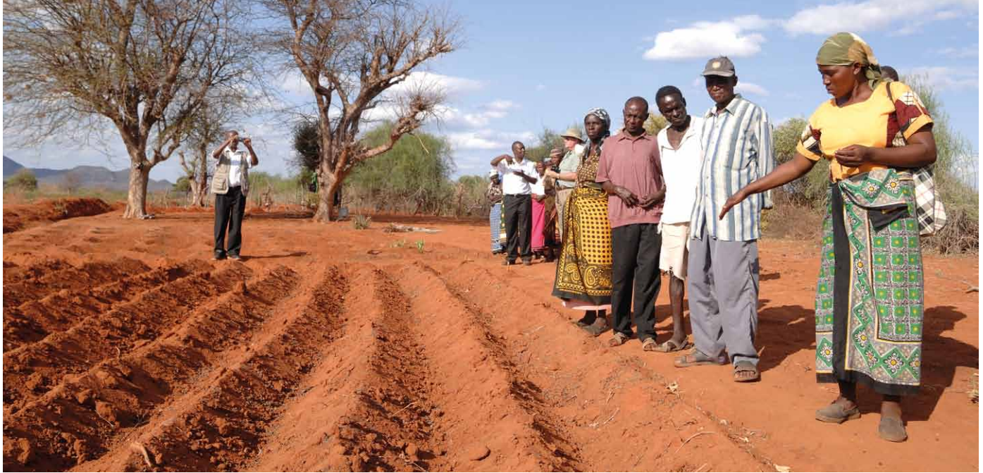
Farmers visiting the Nyaani Soil Conservation and Water Catchment Project in Kenya.

healthy competition, which should lead to greater efficiency.