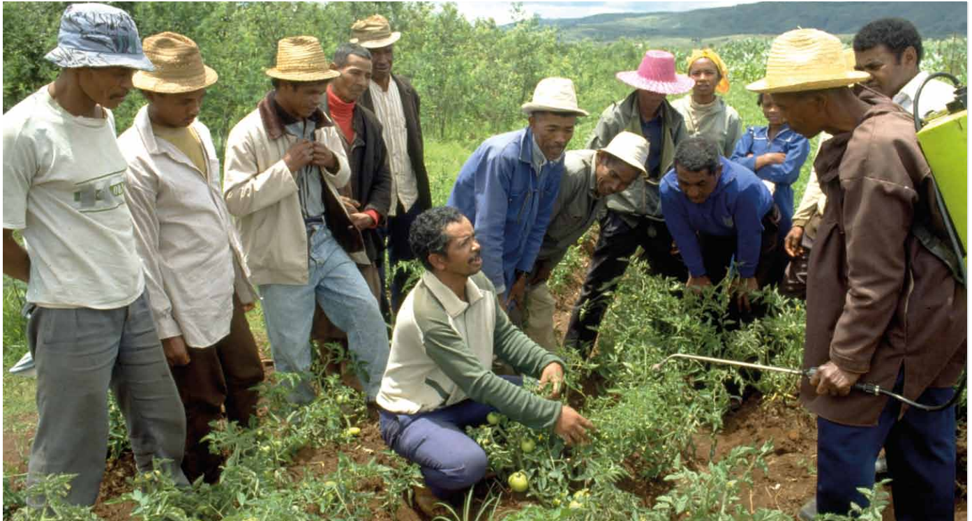
The project extension workers explain tomato diseases and pest control to farmers of Antanetibe, Madagascar.

the adoption of new crops and improvements in livelihoods and incomes. The farmer-first approach has also given them the confidence to make their views known to government and policymakers.